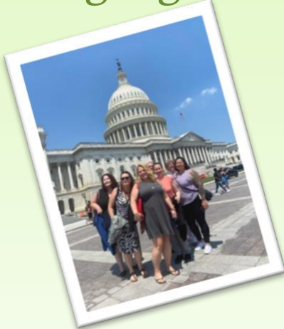
The COPTA group visiting the U.S. Capitol for the NPTA Legislative Conference.

Summer always seems to fly by – does it feel that way to you? As July begins, we are already gearing up for the new school year. For some of our units, school starts at the end of this month! July is the perfect time to wrap up any remaining tasks from the 2021-22 year and work on planning for 2022-23. For most of our units, this includes completing your annual financial review and submitting your unit's newly elected officers! Please reach out if you need help with these or ANY items- we are here to support you!