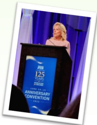
First Lady Jill Biden addressing the NPTA Convention